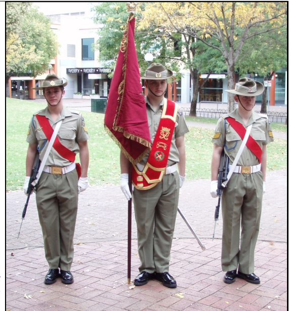
Army Cadets with their Colours prior to the march on ANZAC Day 2005

It should involve and engage with not only the Ex Service Community, but with the Current Serving Community