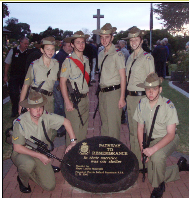
Army Cadets from 47 ACU at the Payneham/St Peters ANZAC Day Dawn Service in 2006. Four of these Cadets are now members of the ADF.

The Army Cadet unit hired 3 commercial BBQs, and purchased enough sausages, bread and onions to feed 3,000 people. With sauces and serviettes, tables and chairs, plus sufficient cooking implements and 5 bottles of gas, 3 trailers were needed to move all the gear to Torrens Parade Ground at 0700 hrs on 25th April 2004. The day came and went, with Officers of Cadets and parents of the Cadets doing all the cooking and serving, and the Cadets themselves keeping the ice boxes full of soft drinks, chopping more onions and just generally helping out. (For OHS