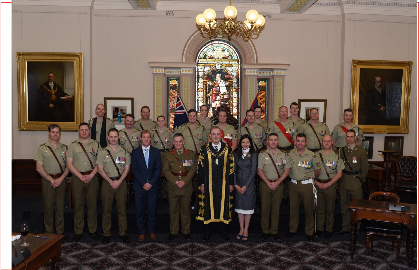
Officers and WOs after the Freedom of Entry Parade invited into the Mayoral Chambers of the Adelaide Town Hall

The 2019 RSAR Association Calendar is attached to this newsletter. There is no reason for missing a function or meeting.