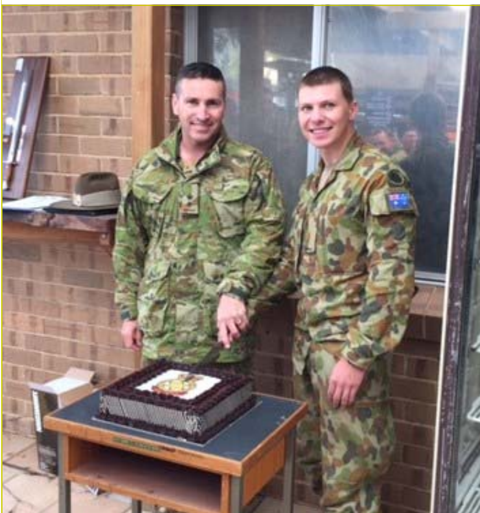
The CO 10/27 Bn and a young digger cut the Family Day cake.