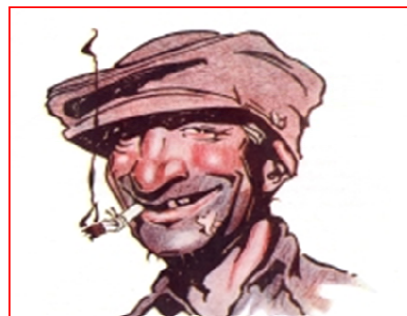
Private Gomad reckons.....