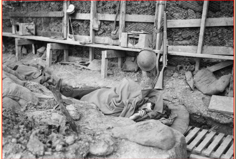
Wrapped in his overcoat, an unidentified Australian soldier sleeps in the trenches in the Bois Grenier sector