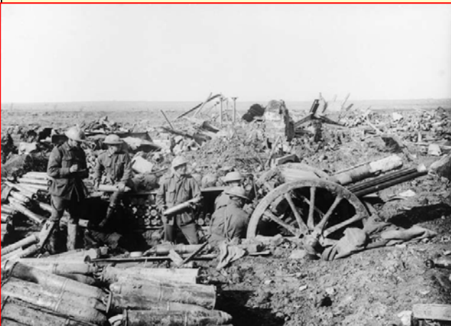
AWM E01209. An 18-pounder gun of the Australian Field Artillery dug in among the ruins of an old factory.

later, he sent out Sergeant Mudford's covering party. 3 Using the tape as a guide in the dark, they took up positions in the German wire emplacements—a mere 45 metres from the enemy. The main raiding party moved out, passing through the gaps that had been cut in the wire. Suddenly, a flare burst above them, creating pandemonium as the pale light illuminated the battlefield. 'Go! Go! Go!' Brodie yelled, waving his troops forward.