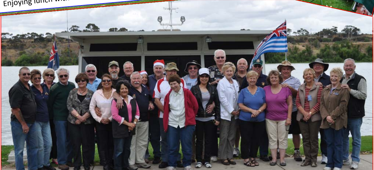
Happy campers line up for the obligatory "Company Parade photo." No need to tell anyone to "Smile!"