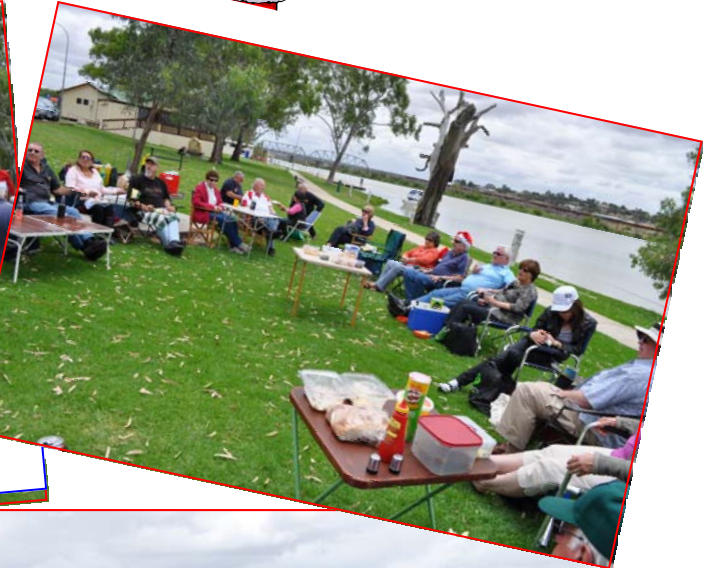
Enjoying lunch with Beamsy's bus in the background