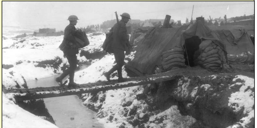
France. January 1917. Australians of the 5th Division crossing a frozen trench