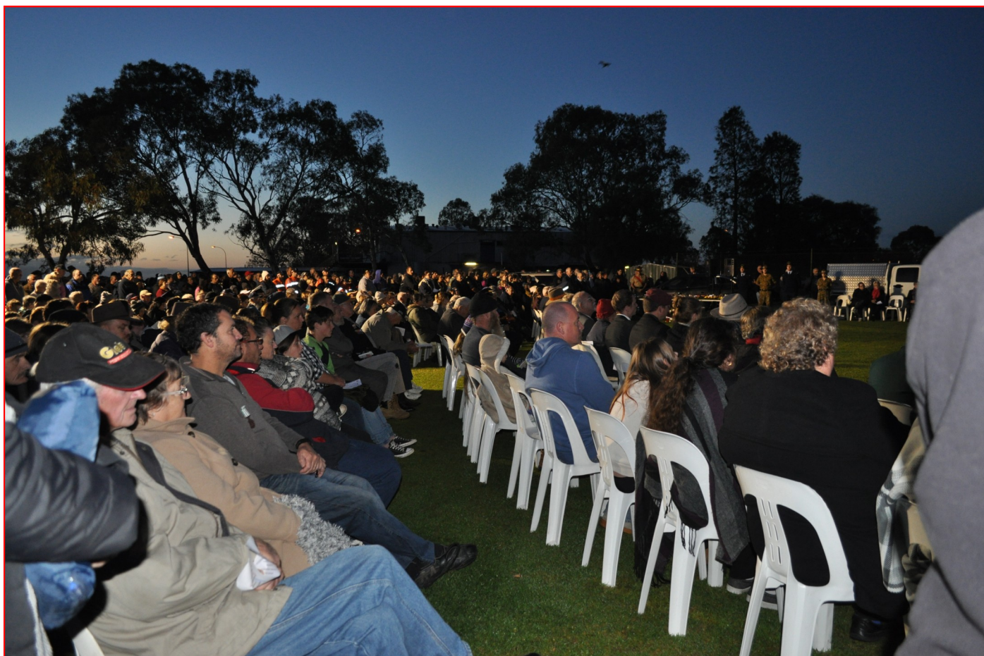
Some of the 2,000 locals and visitors who attended the Murray Bridge Dawn Service at Sturt Reserve on ANZAC Day 2017. The service was conducted in chilly but dry conditions, with nearly 1,200 folks enjoying the traditional Gunfire Breakfast afterwards.