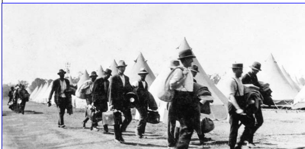
Liverpool, NSW, 1914. New recruits moving through the Army camp lines.