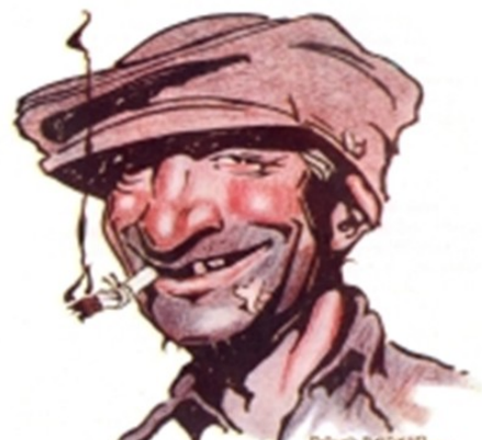
Private Gomad reckons.....