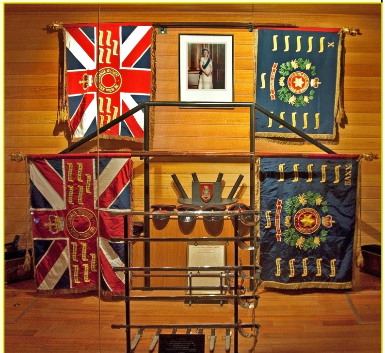
The 10th and 27th Battalion Colours.

The 50th Anniversary of The Battle of Long Tan is to be commemorated in August this year, and I know ex-servicemen and women all over the country are planning to remember those who went before and paid the supreme sacrifice. Likewise, we should make the effort to remember those who also signed up to "do their bit!"