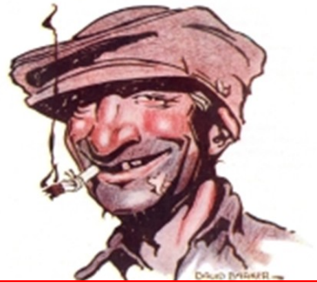
Private Gomad reckons.....