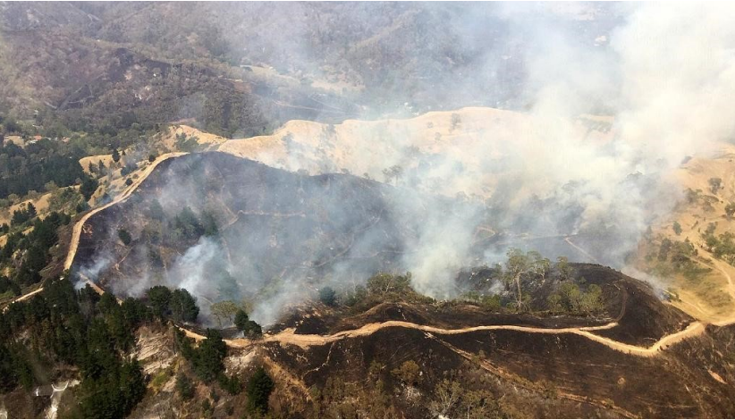
The SA Cudlee Creek fire spread over thousands of hectares.

The community also listened and acted when we issued warning messages. Those three lives lost to