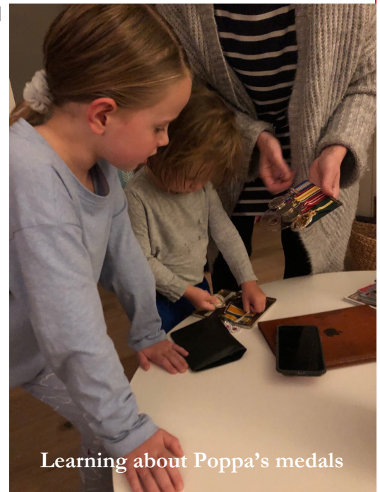
Learning about Poppa's medals

The morning was beautiful. Crisp but not cold. As the dawn broke the clouds turned an amazing pink as they were lit from beneath by the rays of the rising sun. The familiar Australian bird song was welcome and as we stood in the breaking light the sound of the Last Post drifted through the air from a nearby memorial or street gathering.