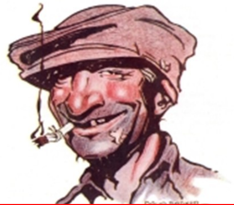
Private Gomad reckons.....