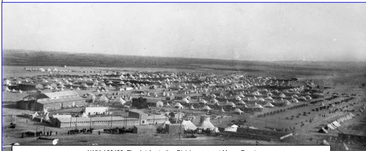
AWM A00429. The 1st Australian Division camp at Mena, Egypt

He was evacuated to Malta, but it wasn't until the following March that Eric was fit enough to rejoin the battalion, which was now back in Egypt, following the successful evacuation of ANZAC in late December 1915.2 During a muster parade, Eric heard that the battalion was to be split to help form units of the new 4th and 5th Divisions of the AIF. Volunteers were also being called for service in the newly formed Imperial Camel Corps.