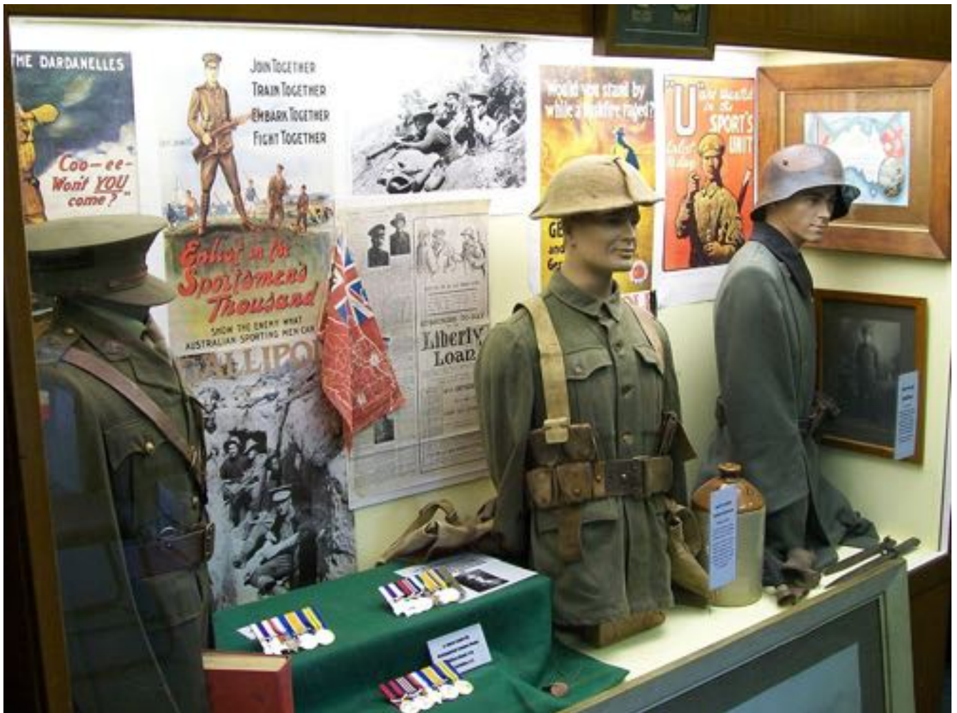
ABOVE: A World War One display case

Donations of 8/7 RVR memorabilia and other military items are welcome.