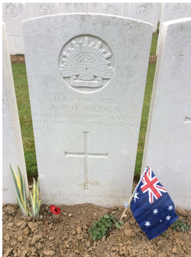
Pte Olden's grave

And, for a short time on ANZAC Day 2015, a later comrade from your Battalion paused, placed an Australian flag at your feet and said a silent prayer. You are in good company.