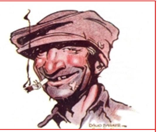
Private Gomad reckons......