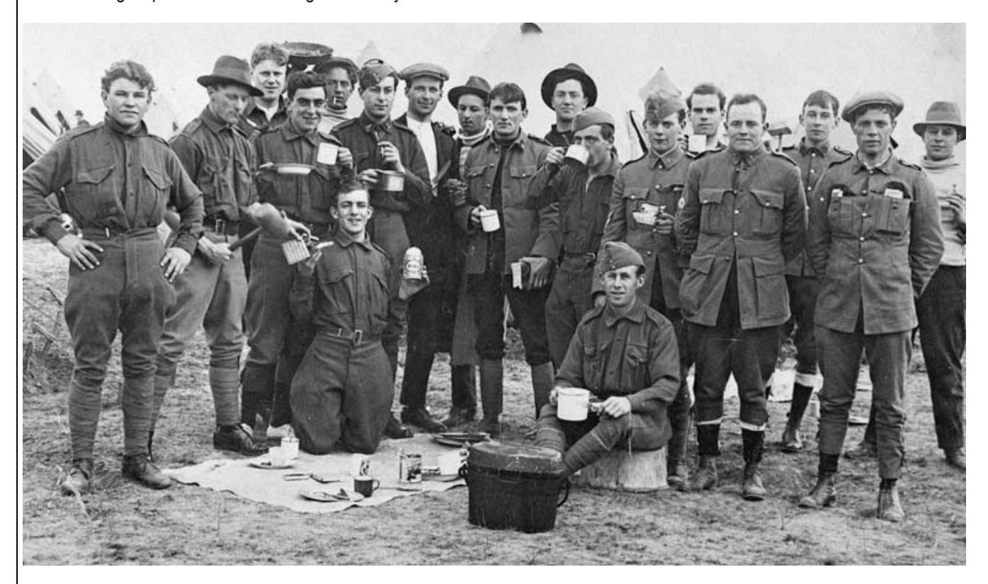
Broadmeadows, Vic, 20 October 1914. New recruits to the AIF pause for a mug of tea during training in camp.

The Turkish riflemen fired wildly at the approaching horde. At the sight of the rampaging Australians, some Turks threw down their weapons and ran towards the town, others chose to fight to the end. The defenders were ordered to save the guns and the Turkish horse teams galloped forward to salvage what they could.