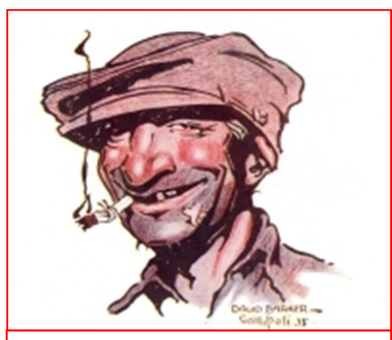
Private Gomad reckons......

Health nuts are going to feel stupid someday, lying in the hospitals, dying of nothing.