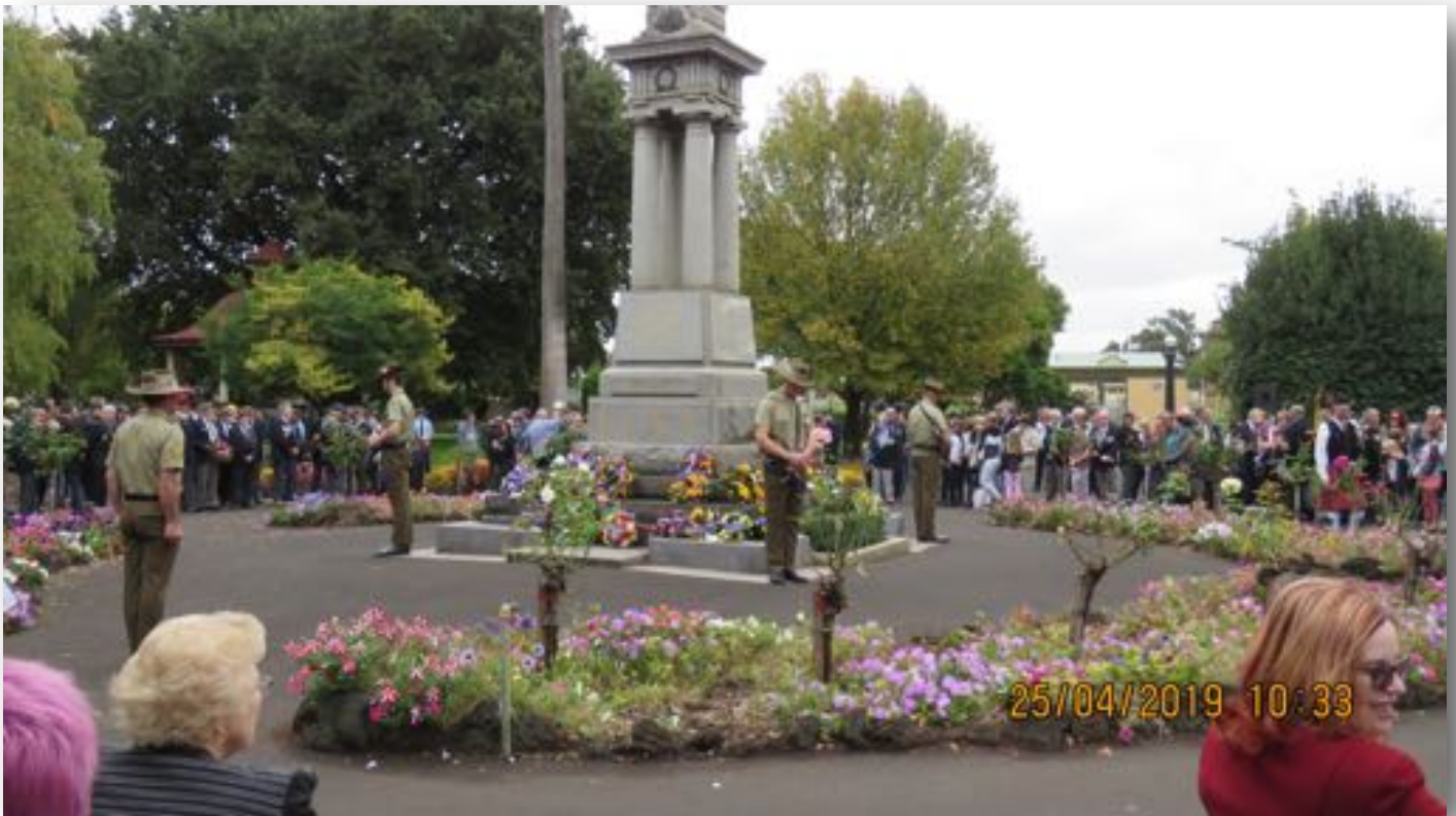
ABOVE: The Catafalque Party from 10/27 Battalion RSAR formed up on the Memorial at The Cenotaph.