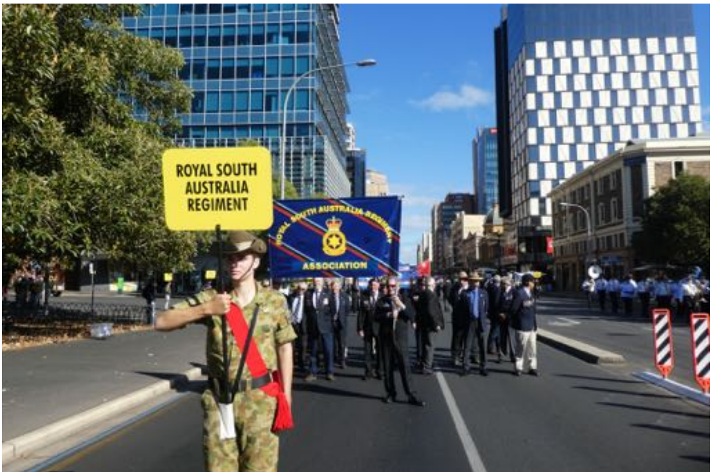
BELOW: The Association forming up prior to the Adelaide 2019 ANZAC Day march