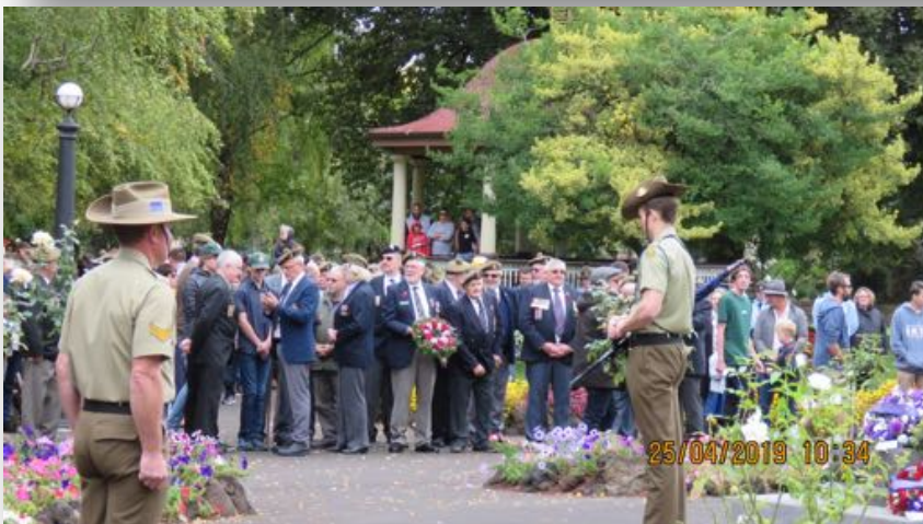
LEFT: Part of the large crowd at The Cenotaph