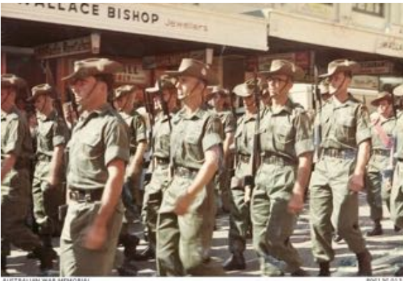
6 RAR march through Brisbane on their return from South Vietnam in 1967

Anti Vietnam War protests in Adelaide in 1971