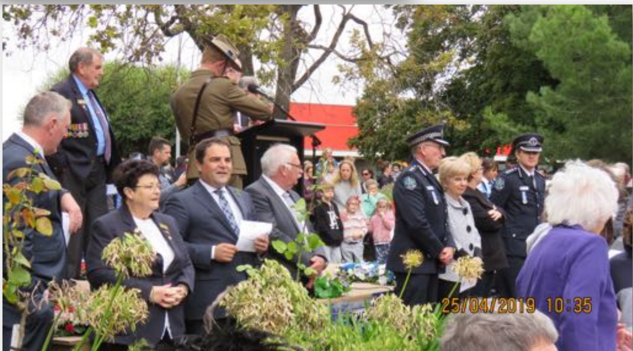
BELOW: Dignitaries including Federal Member for Barker, Tony Pasin MP attended the ANZAC Day Commemoration Service.