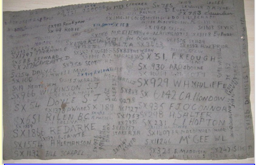
Reverse side of 2/10th Bn flag with names of soldiers