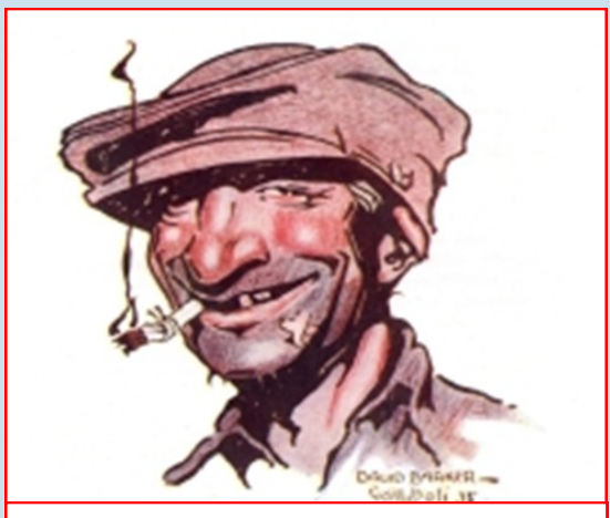
Private Gomad reckons......

Me first born child turned 18 and decided to join the Army. God only knows why!! I got this letter from the barracks about a month later.