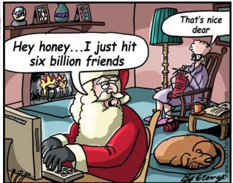
Santa on Facebook