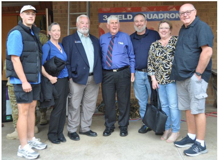
Special guests were members of Rod Beames family who were invited without Rods knowledge to see the Presentations.