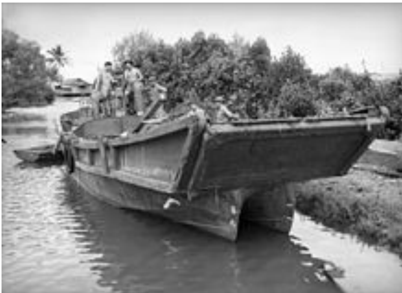
One of the Japanese barges after the battle. The fluted bottom allows the barge to retract from the beach easily.

Japanese aircraft soon discovered the Allied presence at Milne Bay, which was appreciated as a clear threat to Japanese plans for another seaborne advance on Port Moresby, which was to start with a landing at Samarai Island in the China Strait, not far from Milne Bay. On 31 July the commander of the Japanese XVII Army, Lieutenant General Harukichi Hyakutake, requested that Vice Admiral Gunichi Mikawa's 8th Fleet capture the new Allied base at Milne Bay instead. Mikawa therefore altered his plans for the Samarai operation, and substituted the capture of Milne Bay, which was codenamed Operation RE , and scheduled for the middle of August. Operation RE received a high priority after aircraft from the 25th Air Flotilla discovered the new Milne Bay airfields on 4 August, but was then postponed due to the American landings on Guadalcanal on 7 August.