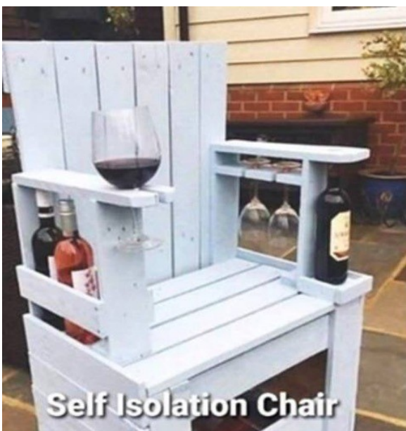
Self Isolation Chair