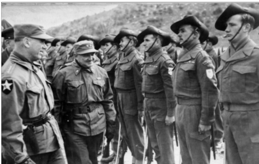
General J. Van Fleet, General Officer Commanding, US Eighth Army, inspects members of the 3 RAR while bestowing the Presidential citation in recognition of the unit's action at Kapyong. 083857